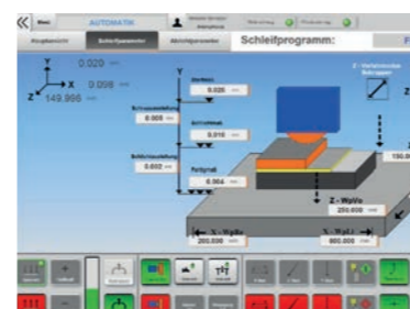
EXAMPLE IMAGES NCT CONTROL