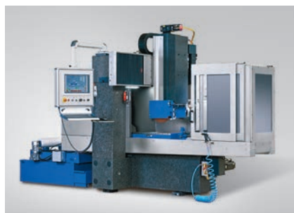
FD portal grinding machine From 800 x 400 mm onwards