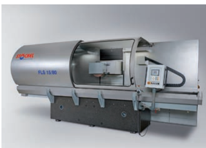
FLS column design Grinding width: up to 800 mm