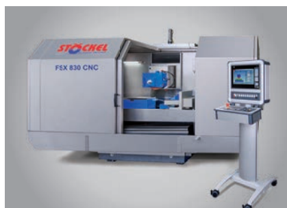
FSX flat and profile grinding machine Up to 800 x 400 mm