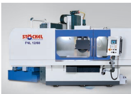
FL travelling column design From 1000 x 500 mm