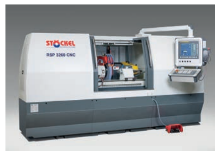
RSP circular grinding machine Up to 2000 x 500 mm