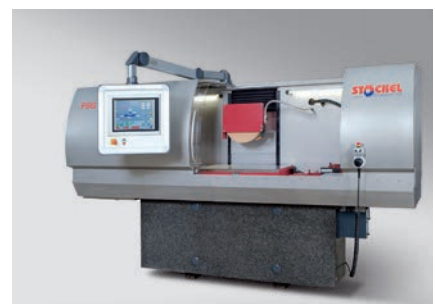
FSG profile grinding machine Up to 1200 x 400 mm